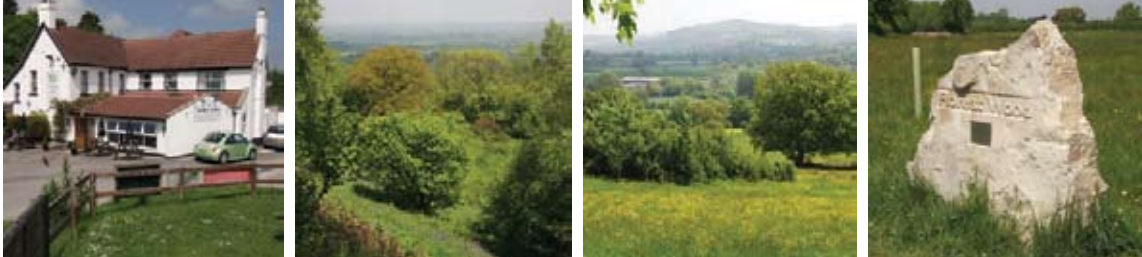
1 2 3 4